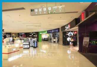
Dashikou Underground Shopping Street

Shopping in Zhenjiang is easy as a pie. Most major brands are available in Wanda plaza and Yaohan Mall. For students who go on budget, Daxiang Fashion street and the long underground shopping street in dashikou is a good choice.