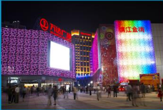
Wanda Plaza (万达广场)