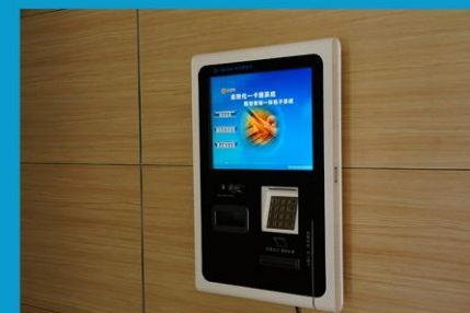
Campus Card Kiosk