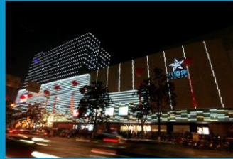
Yaohan Mall (八佰伴)