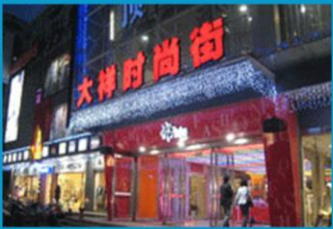
DaXiang Fashion Street (大祥时尚街)